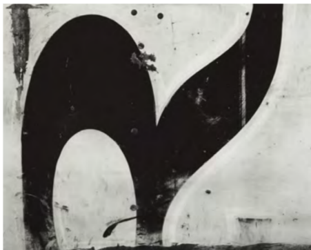
AARON SISKIND (1903 - 1991), 'Chicago 30', 1950, gelatin silver print, printed 1979

We have also delved deeper into the extraordinarily rich and exciting oeuvre of South American photography. São Paulo was Brazil's hub of art photograph from the 1940s through the 1960s. Thomaz Farkas, Gaspar Gasparian, and Marcel Giró were prominent exponents of the São Paulo school. Geometric abstractions, bold black-and-white contrasts, and atmospheric movement studies were hallmarks of their work.