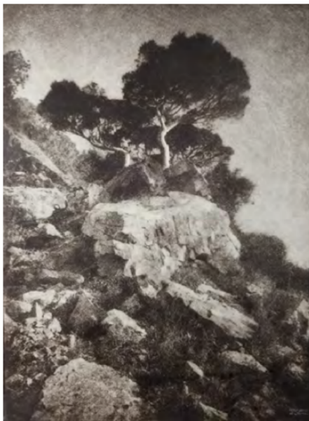
HEINRICH KÜHN (1866 - 1944). 'Untitled (Landscape)', ca. 1898, brown gum-bichromate print, printed ca. 1898

Alongside the works of the second avant-garde at mid century, we are also presenting a small exhibition of the works of Pictorialist Heinrich Kühn. One of the most significant proponents of art photography at the turn of the twentieth century, Kühn was an authority on the gum bichromate printing technique. From the mid 1890s, he developed a visual language centered around landscape motifs, in which he tested the interplay of shapes and surfaces, light and shadow, and thus created a foundation of modern artistic vision. Indeed, Kühn's and the Pictorialists' focus on free artistic creativity in photography remained influential to Otto Steinert who used to mention their exemplary attitude with high esteem. We have taken the opportunity here to show some of Kühn's rare large format landscapes.